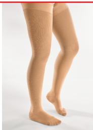
AG Thigh Length