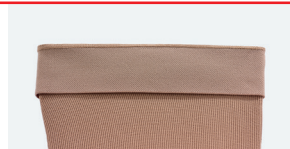
Elastic Band – 5cm