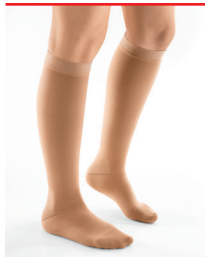
AD Below Knee