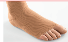
Open toe – Oblique Finish