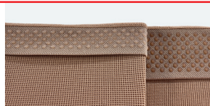
Silicone Band – 3cm & 5cm