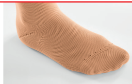
Closed toe – Oblique Finish